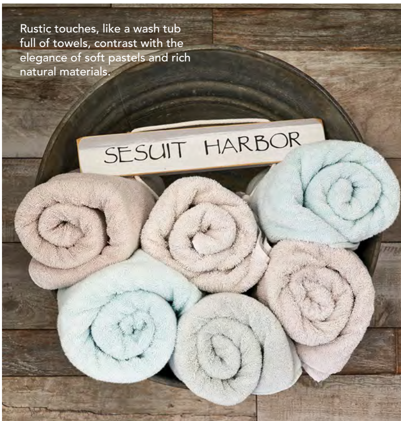
Rustic touches, like a wash tub full of towels, contrast with the elegance of soft pastels and rich natural materials.