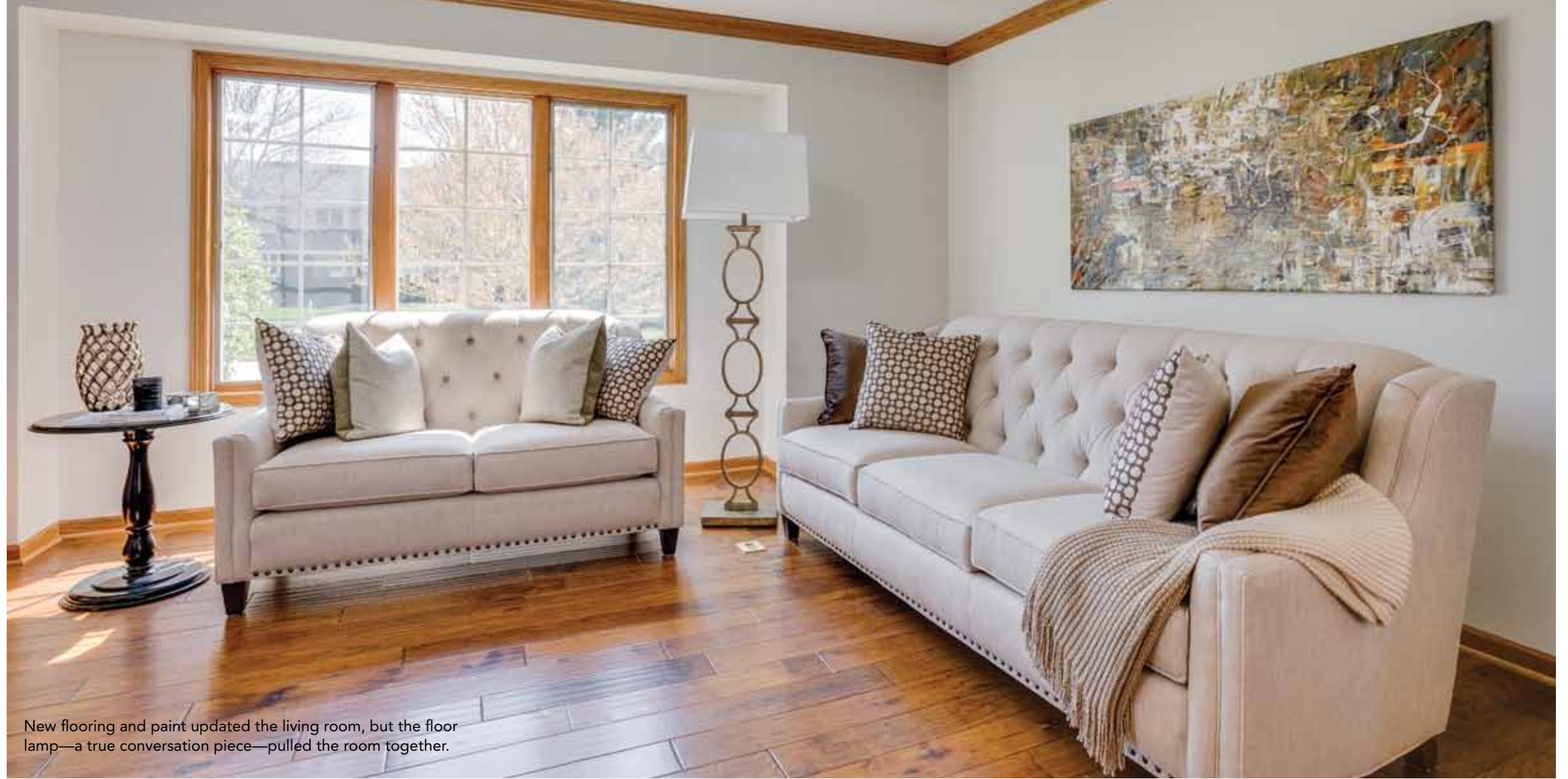
New flooring and paint updated the living room, but the floor lamp—a true conversation piece—pulled the room together.

“All our guys are great,” Marske says, “and they’re really one of the things that set us apart. We have our own crew, and they do more than just follow our plan. They understand the design and the thought process behind it. So when bumps come along like