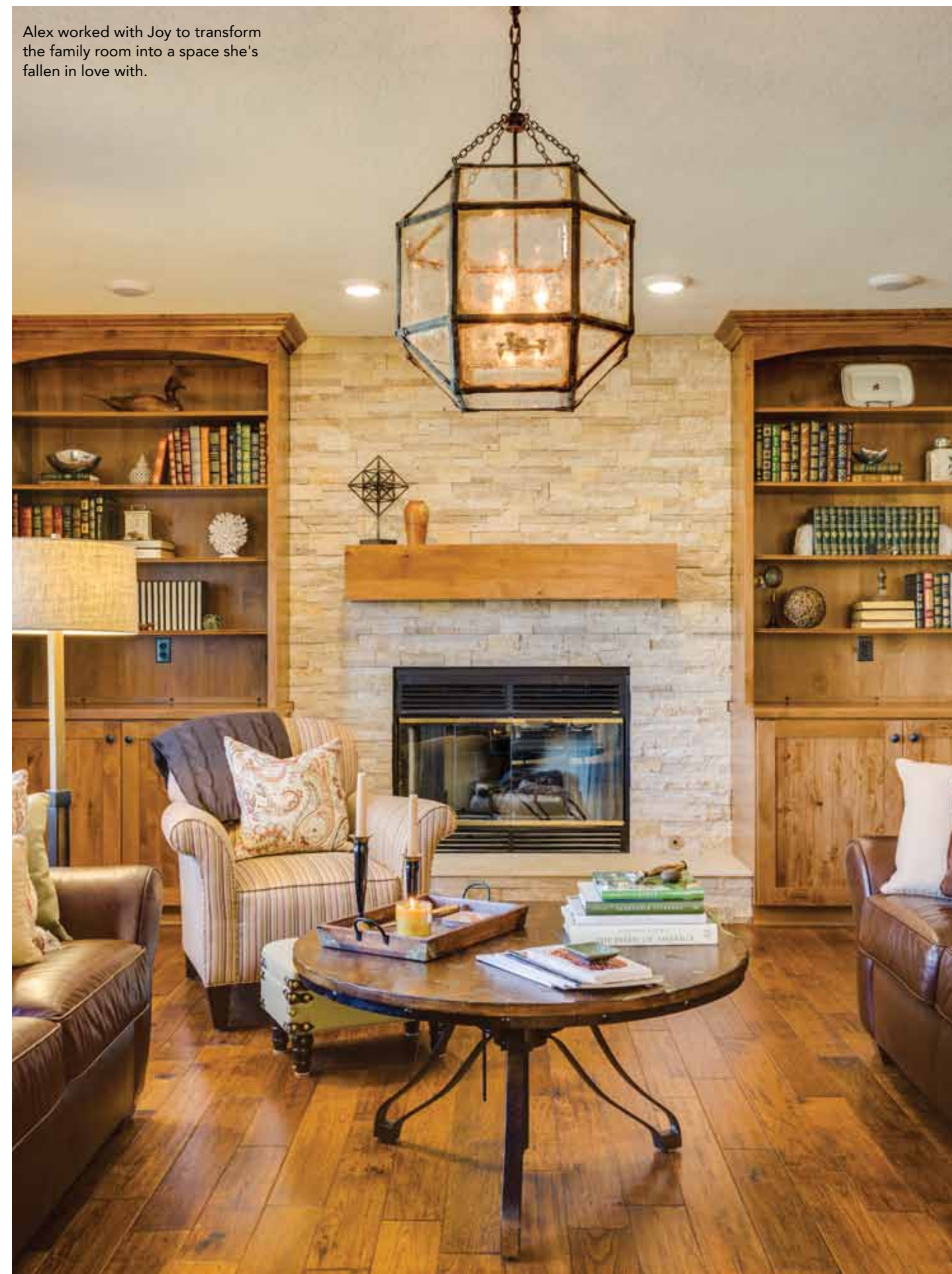
Alex worked with Joy to transform the family room into a space she's fallen in love with.

Slate gray porcelain tile to mimic stone replaced worn linoleum in the mudroom and offers a classy but low-maintenance transition from the garage to the kitchen. The family room received a new fireplace of stacked limestone, an eye-catching light fixture, and a whole new look.