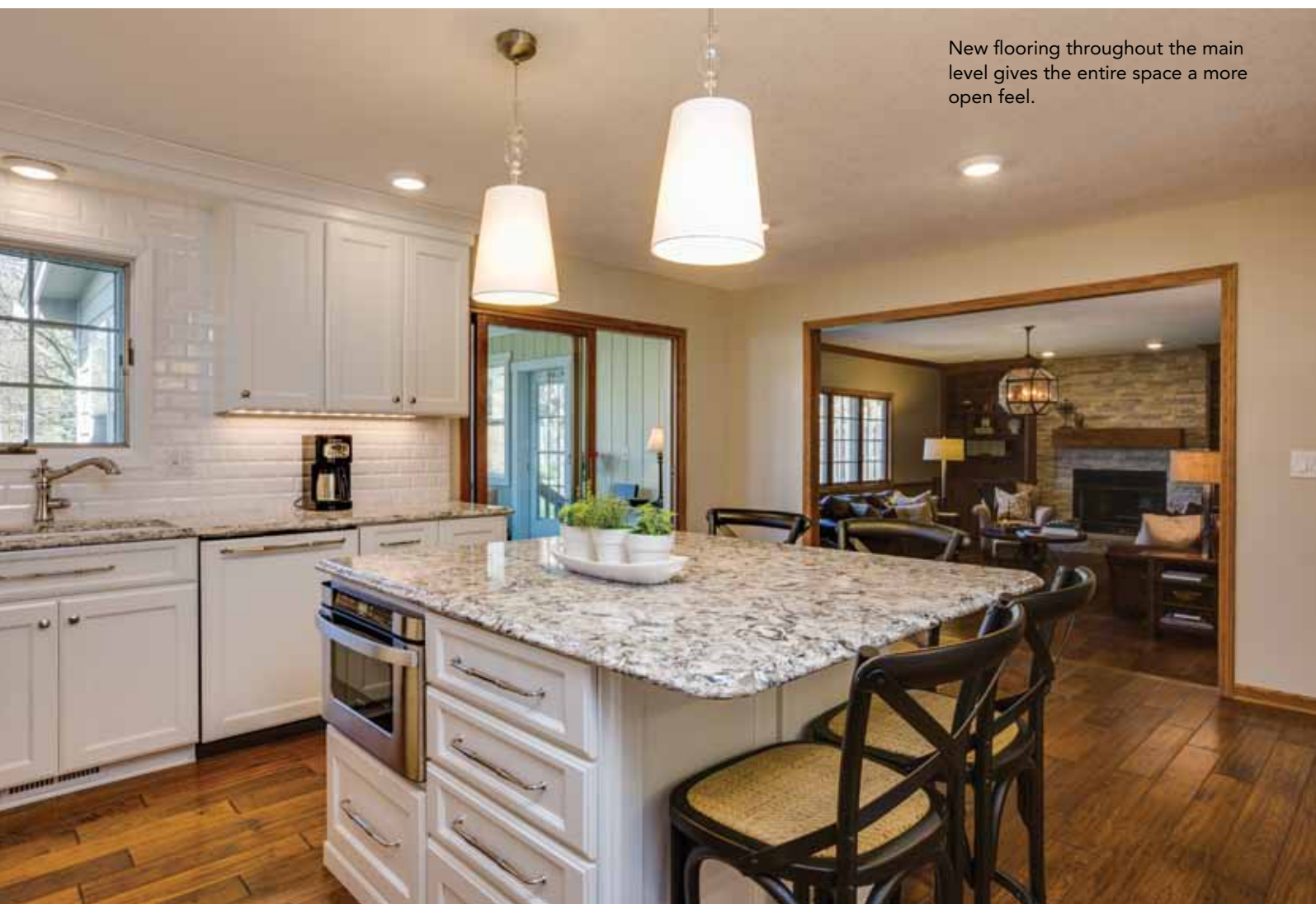
New flooring throughout the main level gives the entire space a more open feel.

More. See even more photos of this spectacular home online at WelcomeHomeDesMoines.com .